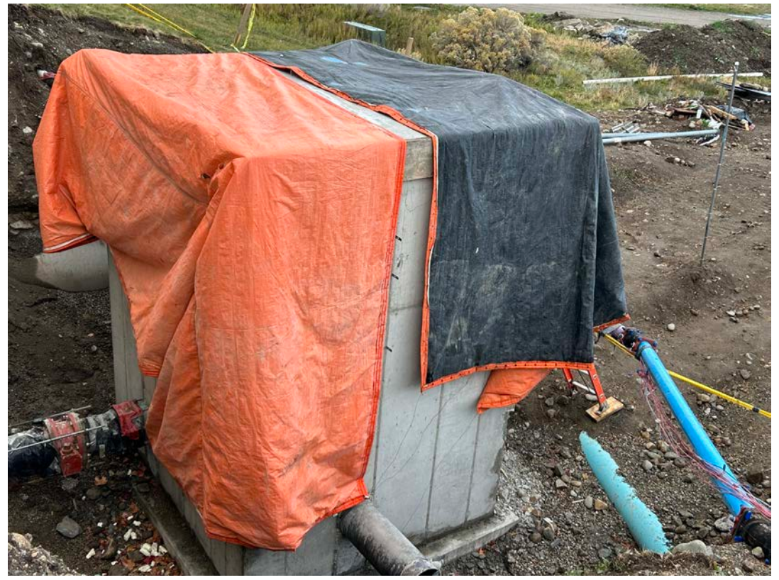
November 8: The ASR Vault was placed.