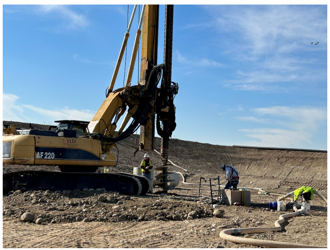
October 24: Drilling for drain holes.