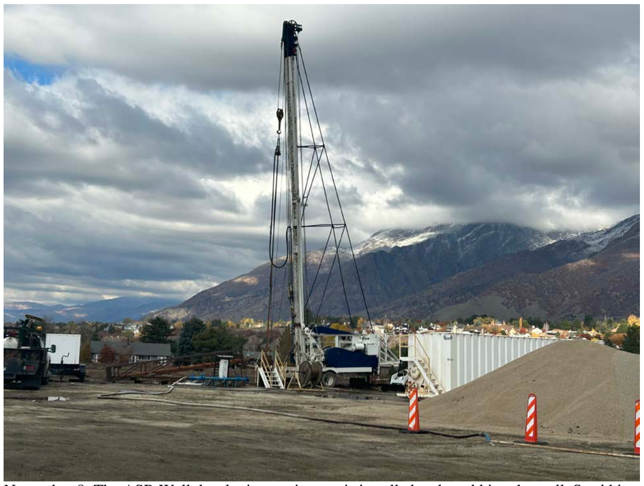
November 8: The ASR Well developing equipment is installed and swabbing the well. Swabbing is a process to kick-start the well by freeing up materials that are caught in the production zone.