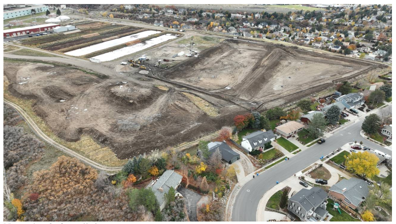
November 8: Overall site progress.

Public input continues to increase as the site is graded, with a big interest on how the site will look post-construction. A flier will be sent to the community in early-to-mid December to share this information.